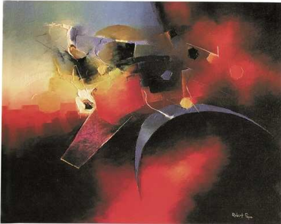
Aesthetison Drive, oil on canvas, Robert Pope

Creativity is an emergent phenomenon patterned by strange attractors, which govern the complexity of information in dynamic flow. If you can't see how to use continually less matter, energy, space, or time (physical resources) in your scheme to improve human performance, then, we submit, that one isn't operating at the 'leading edge' of the tidal wave - somewhere else on the planet things are flowing much faster and more efficiently, and will soon change your game. How can we give people a choice as to which values they want to maximise first, so that different cultures can take different paths toward a diverse yet neg-entropic future? One approach is illustrated by the following painting: